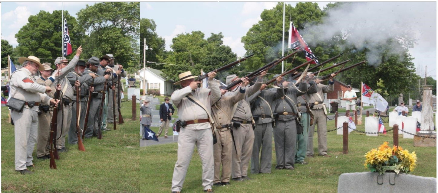
Members of the General Robert H. Hatton Camp acting as our honor guard